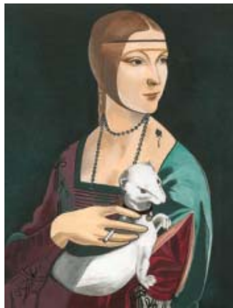
Leonardo da Vinci „The lady with the Ermine”